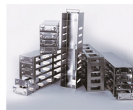
不锈钢冻存架 Stainless Steel Cryo Racks