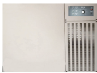
二氧化碳/液氮备用装置 Co2/ LN Standby Unit