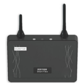
温湿度无线监控云平台 Wireless Monitoring of Temperature and Humidity Cloud Platform